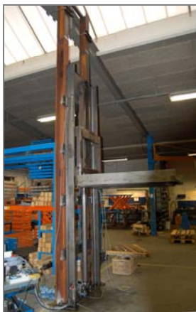
Prototype during construction

Goods lifts based on scissor lifting tables have in several years been an important parts of the Translyft's program.