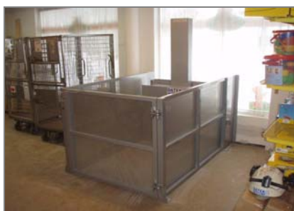
MAST LIFT installed in Norway